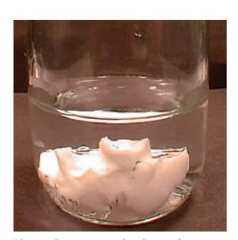
Krytox<sup>™</sup> grease in hydrocarbon solvent is not dissolved.