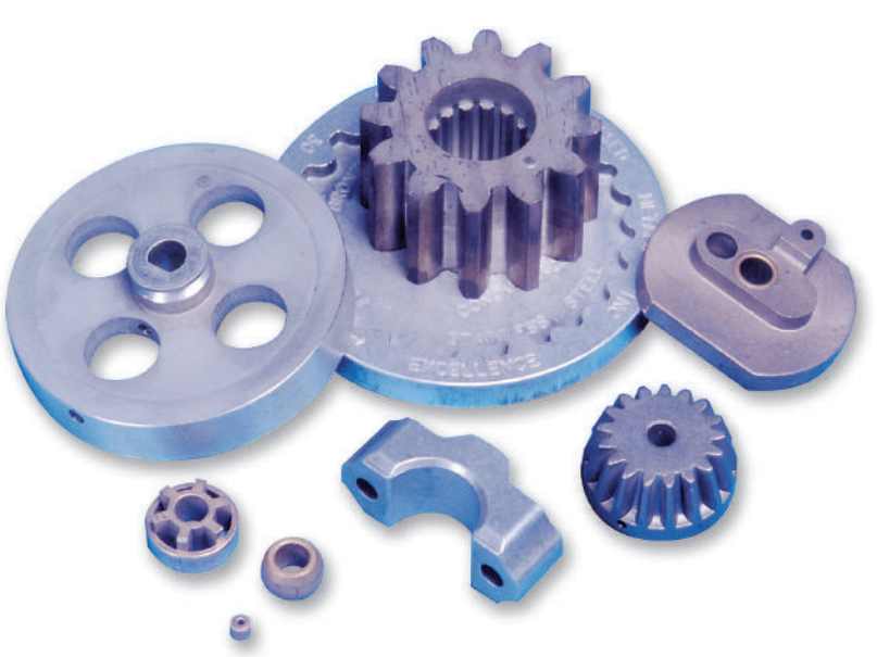
Sintered metal components can be lubricated with \mathsf{Krytox}^{\scriptscriptstyle{\mathsf{M}}} .