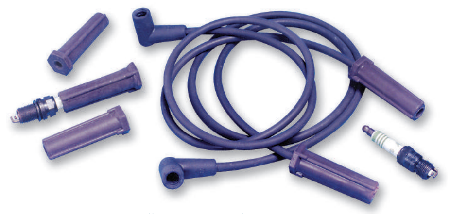
Elastomeric components are unaffected by Krytox<sup>™</sup> performance lubricants.

Some applications require grease that is stiff and does not fall back easily into the bearing races. These systems often run at higher speeds. Harder NLGI grade 3 Krytox<sup>™</sup> greases are recommended for these applications.