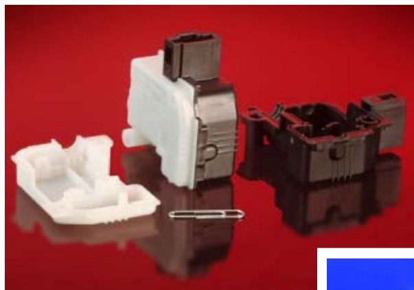
In automotive door lock (left) and fuel vapor canister (below), covers made of natural, laser-transparent PA66 are welded to black, laser-absorbing PA66 housings. Both materials are DuPont™ Zytel® nylon resins.

Medical products: containers, syringes, connectors